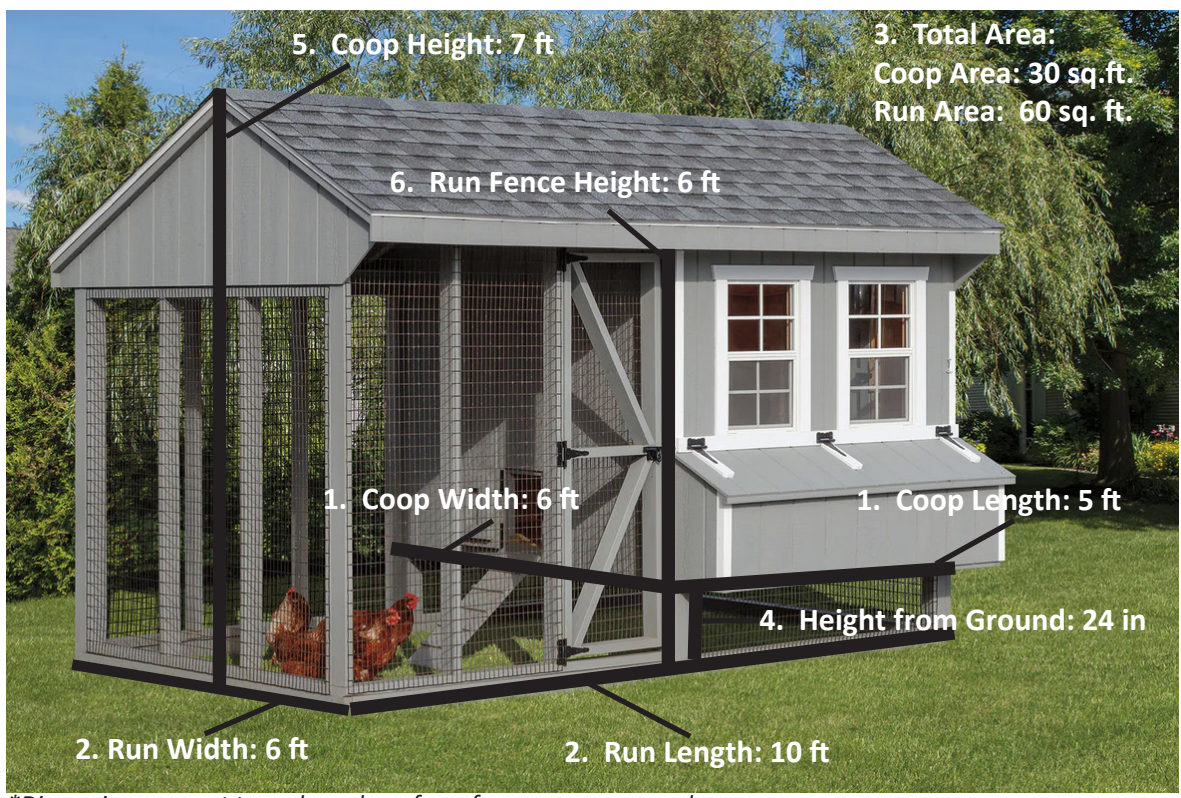
*Dimensions are not to scale and are for reference purposes only.

Chickens need access to daylight in order to be happy, healthy, and produce eggs and also need access to shade to prevent overheating. Make sure to locate the coop and run in a place that will have access to both sunlight and shade throughout the day.