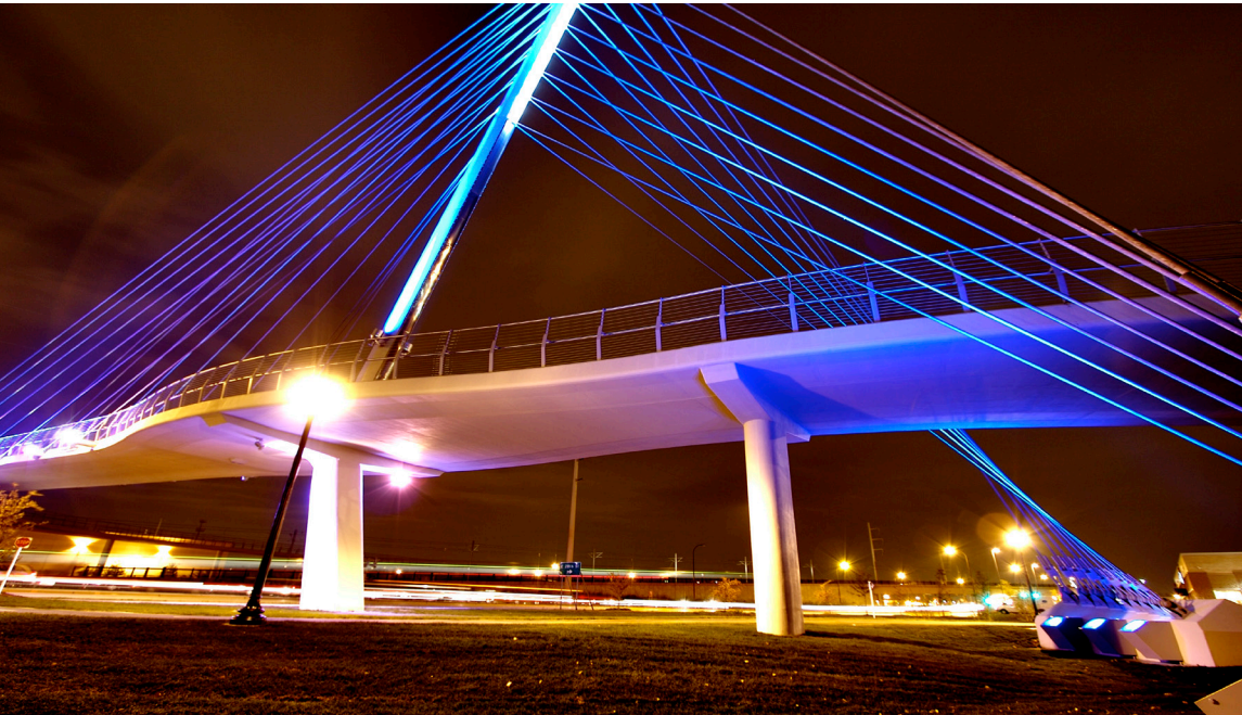
Martin Olav Sabo Bridge, Minneapolis, MN

The amazing amphitheater at Bluestem is home to Trollwood Performing Arts Center and hosts local, regional and national acts for concerts and events enjoyed by the greater metro area and beyond. A pedestrian/bike bridge over the Red River near Bluestem would make it easier for our North Dakota neighbors to partake in Bluestem offerings and reduce traffic congestion during events. It would also further connect the two cities' wonderful bike and pedestrian trail system.