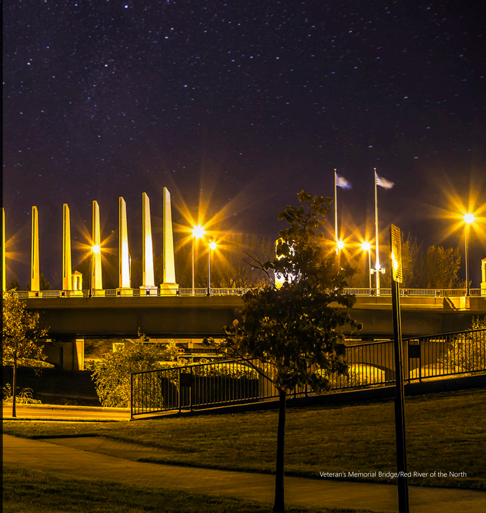
Veteran's Memorial Bridge/Red River of the North