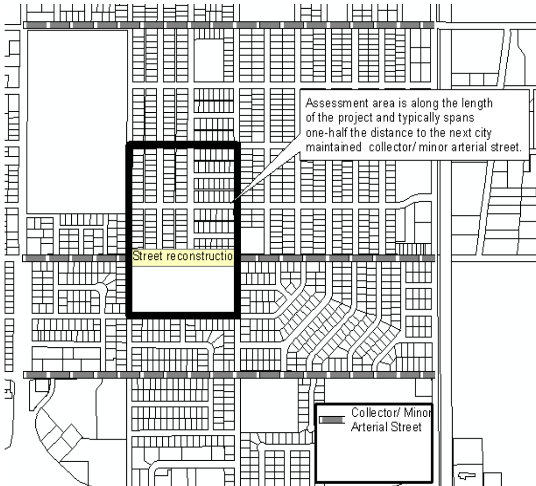
Example of assessment areas for Collector/Minor Arterial streets