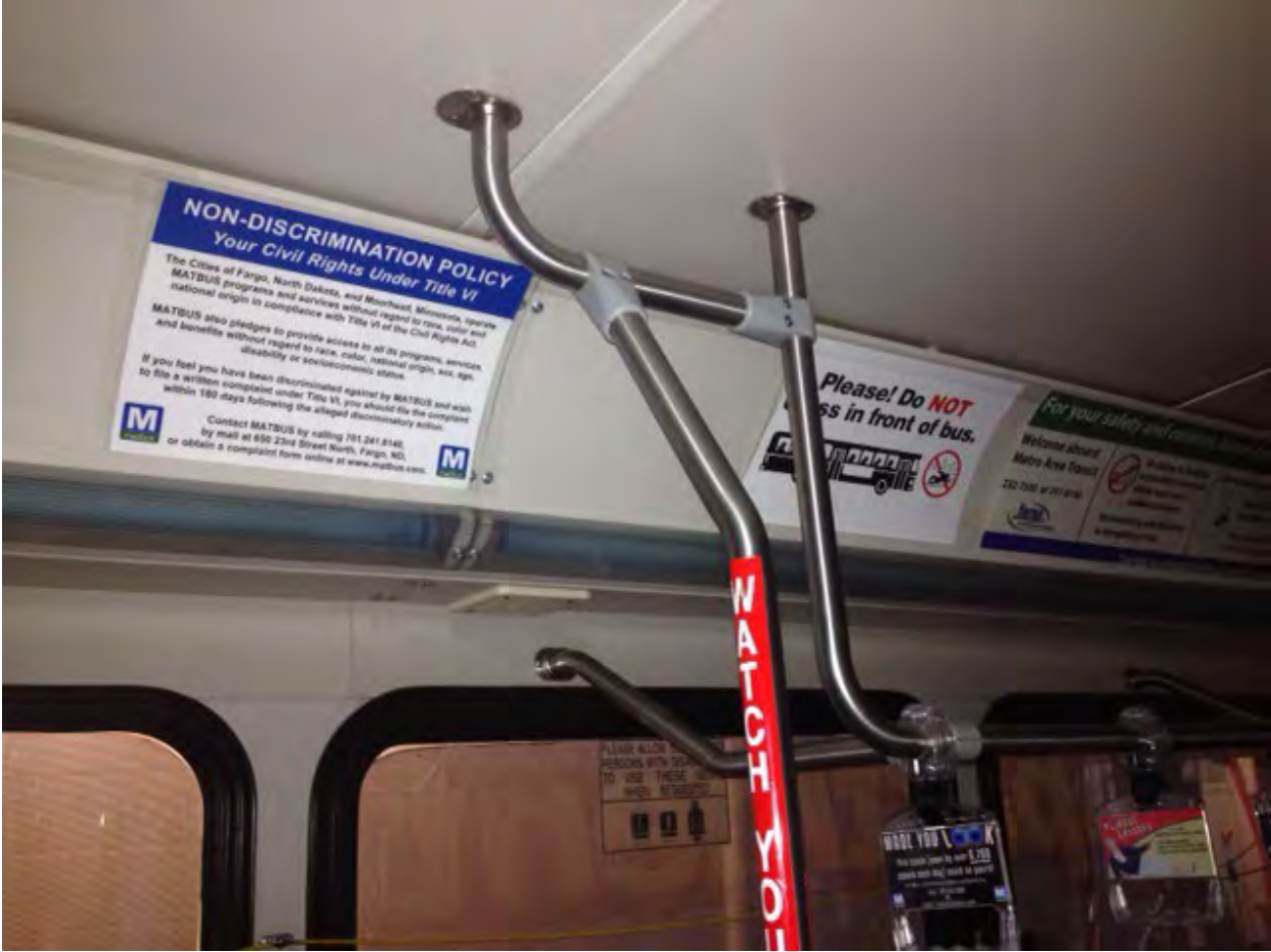
Fixed Route bus