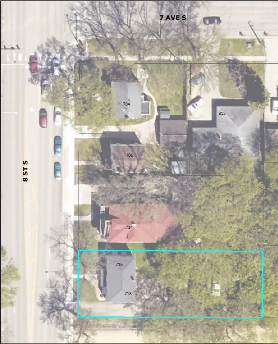
General Location Map – 716 and 718 8 th Street South