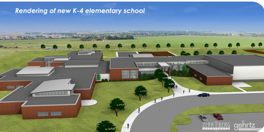
Rendering of new K-4 elementary school

Neighborhood focus: Great care is taken in the design of schools in the Moorhead School District to create a personal learning environment for each student. School buildings are divided into grade-level neighborhoods to provide students a smaller setting with a team of teachers. Neighborhoods (or houses) allow for partnership and collaboration between classes.