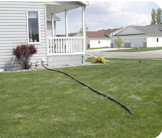
Sump pump discharges must be directed into the yard or plumbed to the curb.

The sanitary sewer system is designed to handle wastewater only, not clear water from sump pump discharges and precipitation. The storm sewer system (street and yard drains, ditches, etc.) has a much greater capacity and is intended to handle water from sump pumps.