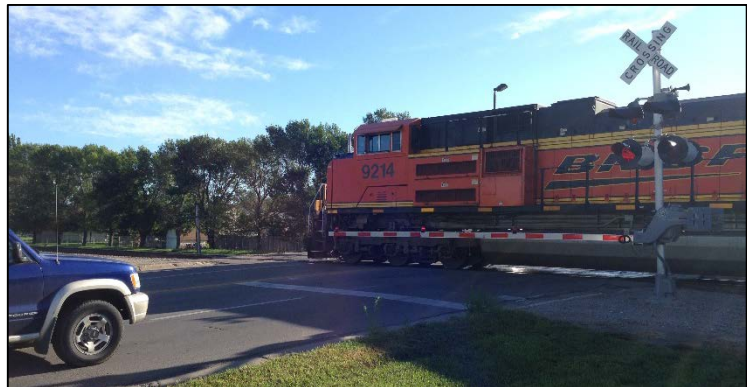
Figure 1 - Vehicle Waiting for Train

The Final Rule on Use of Locomotive Horns at Highway-Rail Grade Crossings includes detailed rules, regulations and requirements to be granted quiet zone status. The City of Moorhead funded a study that stepped through these requirements to develop a proposed improvement plan. This study involved a detailed alternatives evaluation that balanced train-noise reduction, safety risk considerations for motorized and non-motorized traffic and costs to determine the optimal improvement strategy. The proposed strategies are illustrated in Figures 2 and 3 and detailed below.