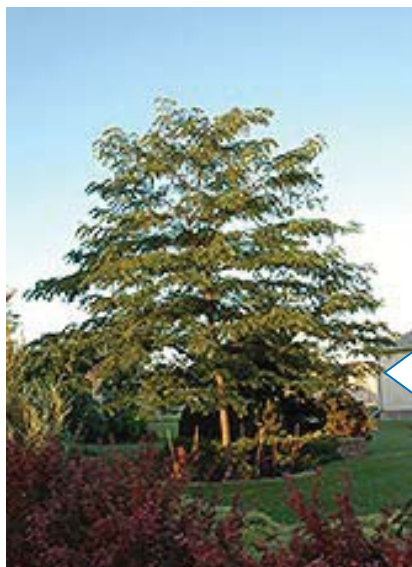
Northern Acclaim Honeylocust