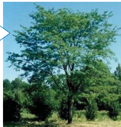
Prairie Silk Honeylocust